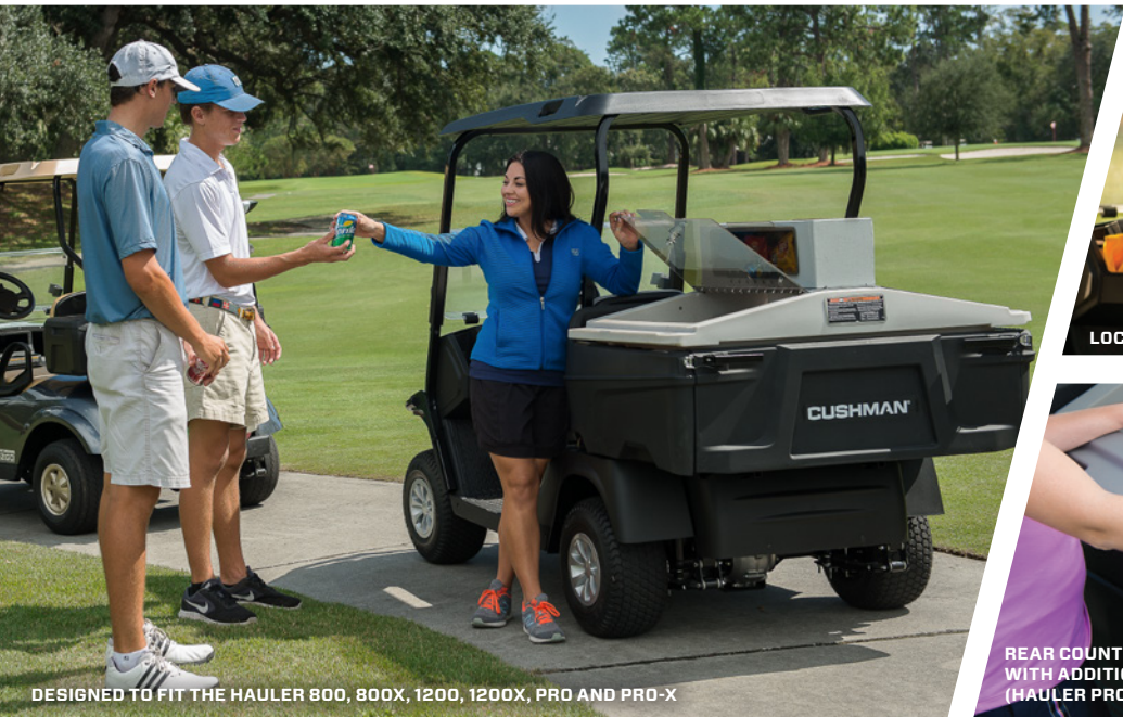
DESIGNED TO FIT THE HAULER 800, 800X, 1200, 1200X, PRO AND PRO-X