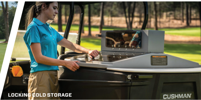
LOCKING COLD STORAGE