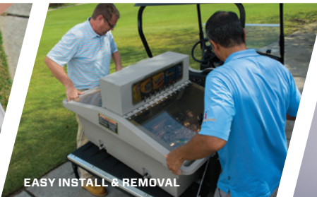
EASY INSTALL & REMOVAL