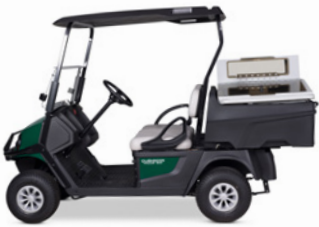
INSTALLED ON HAULER 800