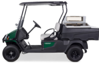
INSTALLED ON HAULER 1200 OR PRO