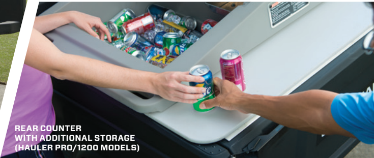
REAR COUNTER WITH ADDITIONAL STORAGE (HAULER PRO/1200 MODELS)