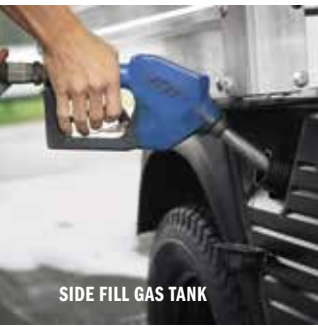
SIDE FILL GAS TANK