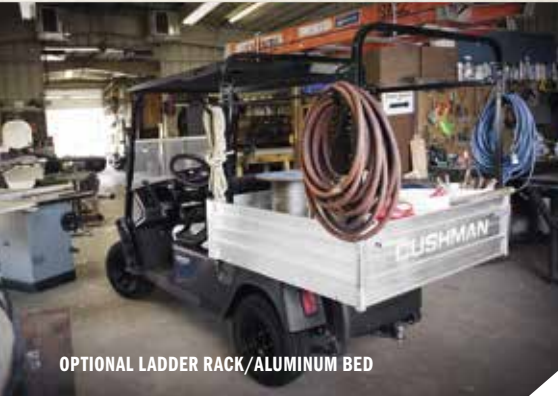
OPTIONAL LADDER RACK/ALUMINUM BED