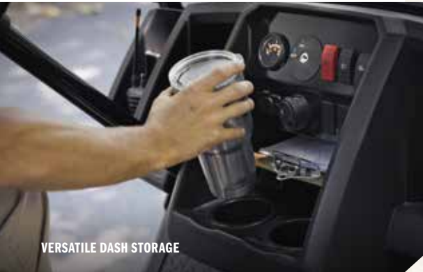
VERSATILE DASH STORAGE